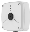
PFA122 Junction box