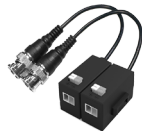
PFM800-E Passive HDCVI Balun