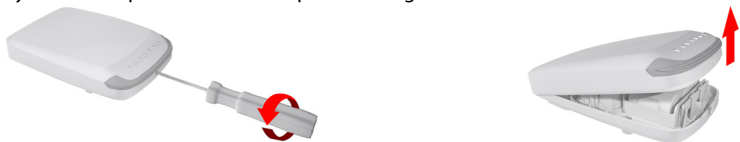
Figure 2: Removing the Top Cover