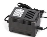
AC24V/3A Power Supply