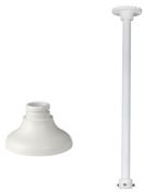
PFA106+PFB220C Adapter Plate + Ceiling Mount Bracket