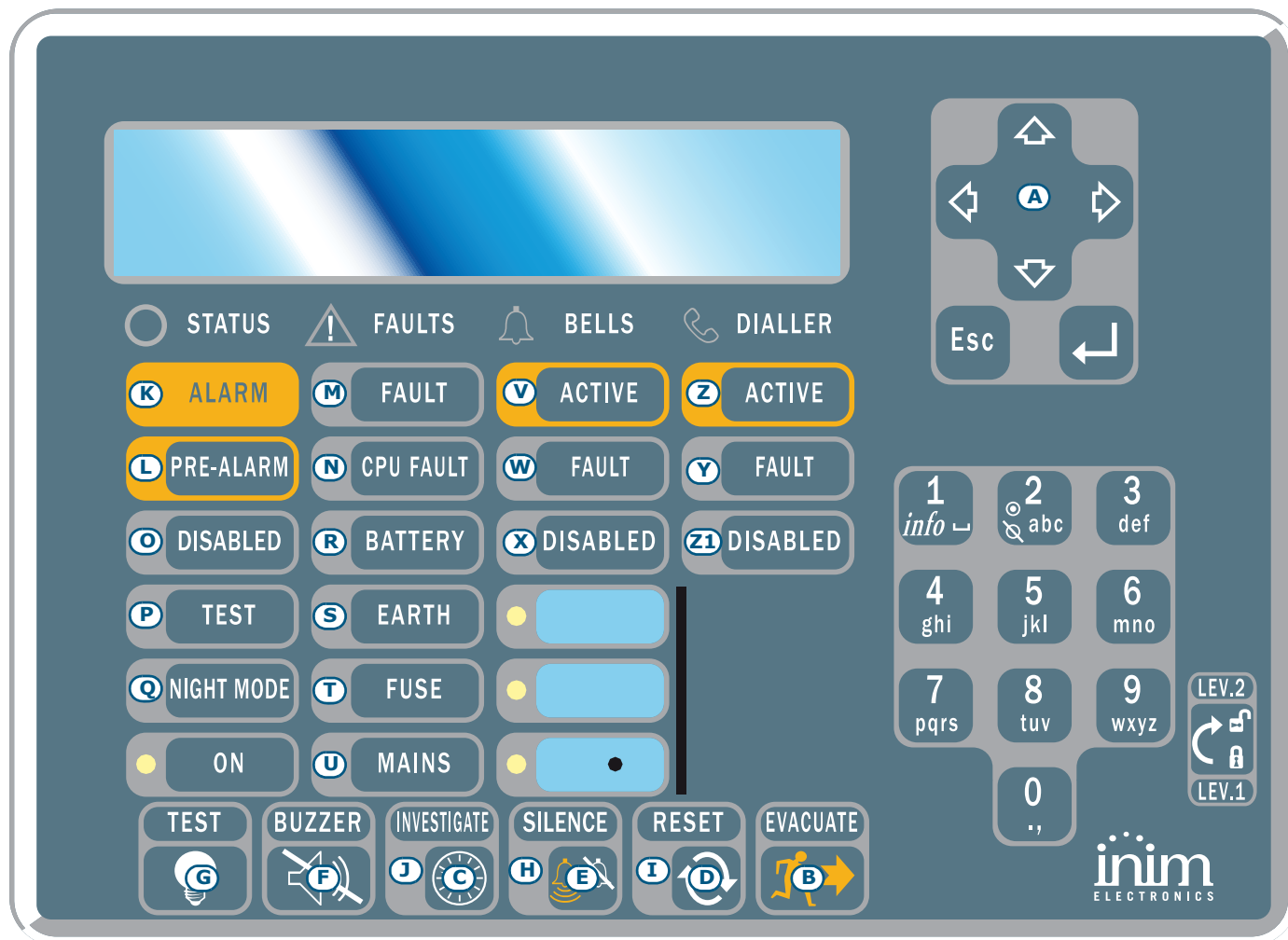
Figure 2 - Front view of the repeater panel

Connected repeater panels replicate all the information provided by the control panel and allow access to all Level 1 and 2 functions (View active events, Reset, Silence, etc.), but do not allow access to the Main menu.